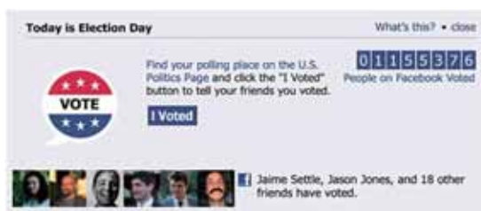
Here is the kind of prompt Facebook sent its users in the 2010 experiment

High ranking search results alter opinions because most people mistakenly believe that search rankings are determined by an objective, omniscient, and infallible mechanism that is beyond human control. This is confirmed by a variety of research on consumer behaviour which shows that people trust and believe higher-ranked search results more than lower-ranked